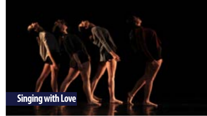
Singing with Love

Master Class on Subharmonic Singing - May 2017