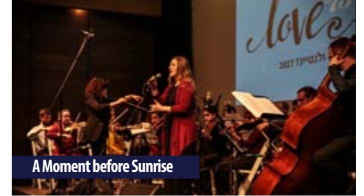
A Moment before Sunrise

The show was called "Love is Love" and included a varied repertoire of love songs from all times: from operatic arias to modern poetry, from familiar classics to spoken word compositions of queer artists. Under the baton and direction of Tom Karni, the multi-disciplinary choir participated voluntarily and with much gusto, as did a chamber orchestra of 25 musicians, conducted by Yael Plotniarz, a JAMD alumni, and over 20 singers in various ensembles, each performing original adaptations, all composed by Academy students and graduates of both the classical and the multidisciplinary composition departments.