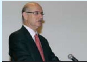
Minister Avishay Braverman